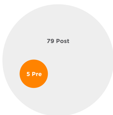
Patient 2: TKT R438W Clones